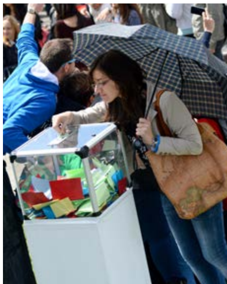
The idea box getting filled with proposals for a better Europe

In the early afternoon, as the participants started making their way home, many questions still lingered: Why did so many of the Members of Parliament cancel their attendance at the panels? Where was the President of the European Parliament, Martin Schulz? Where was the diversity of the European Union - a concept that so many of the activities touched upon, but which was not always reflected by the speakers? After three days of passionate discussion, it was clear that the young attendees wanted to engage in European politics, and while many great ideas for a better Europe were drafted by the nearly 5,500 participants over the course of the event, it is now up to the elected Members of Parliament to act on them.