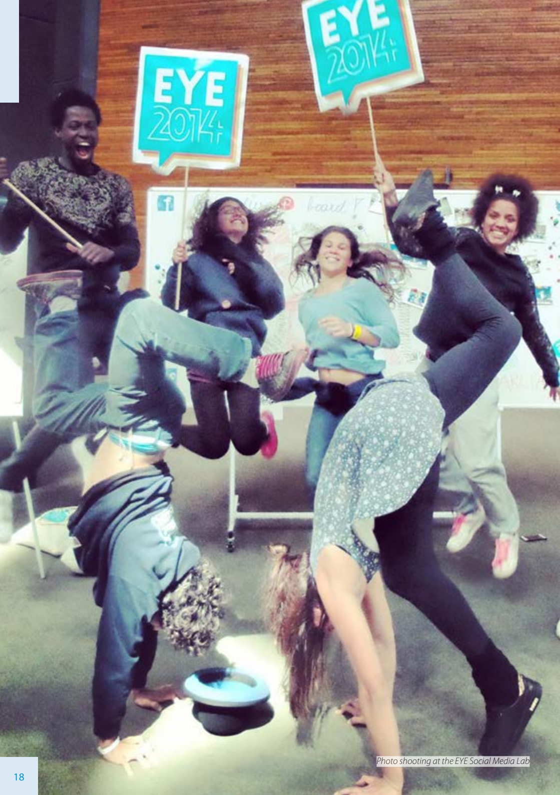
Photo shooting at the EYE Social Media Lab