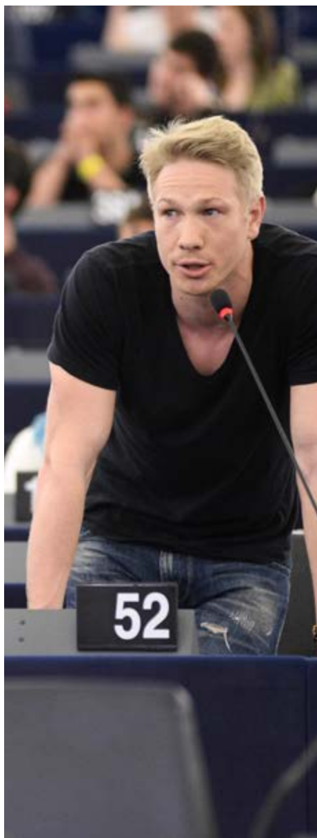
Intervention from the audience

"We need to let the future Members of Parliament know about your ideas. What they will do with them, I don't know."