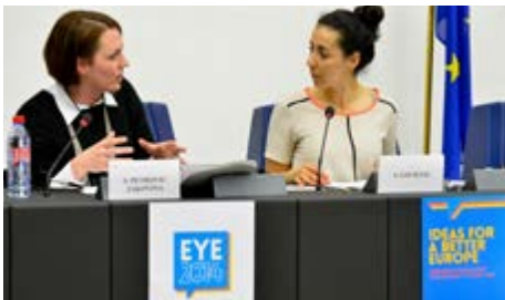
Young MEPs discussing with participants the «smart cities» of their dreams

In order for this to happen, however, issues of equal access and education have to be dealt with.