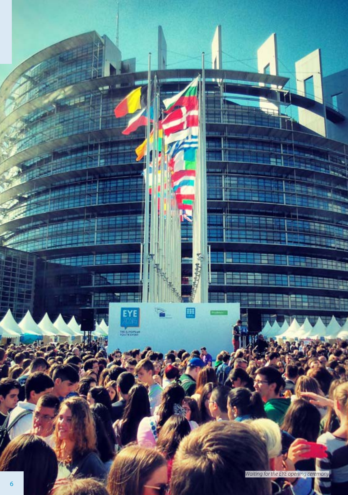
Waiting for the EYE opening ceremony