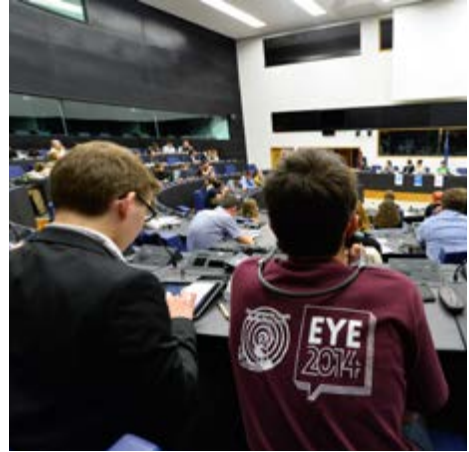
Young EYMD journalist reporting on a panel