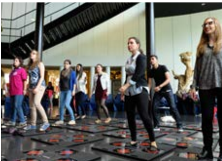
Participants experiencing how technology and fitness can go along with the iDance Machine

Cyber criminality has, without a doubt, changed the law; not only on the level of nation-states, but also in terms of Europe itself. Consequently, it is not surprising to find great interest in problematic cases that have been dealt with by the European Court of Human Rights and the Court of Justice of the European Union.