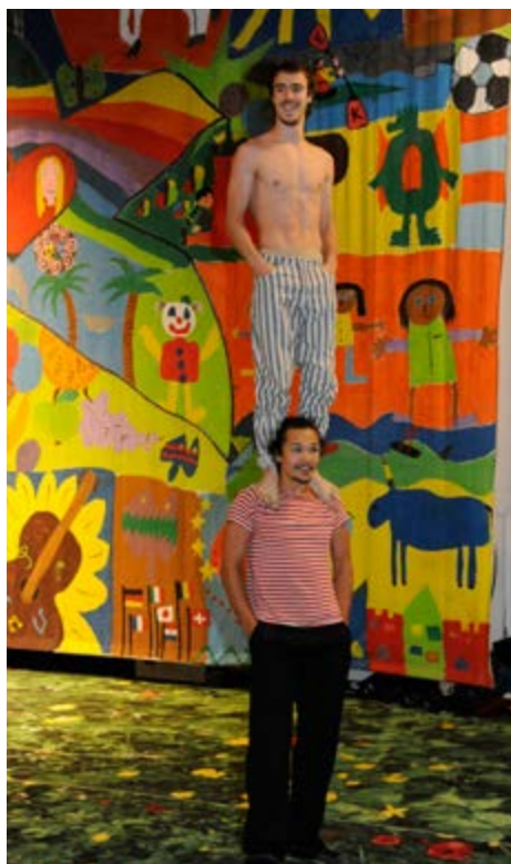
Two young artists performing in the circus show

“All of the problems we have with discrimination, I think we can solve by educating people; it’s all about not having enough knowledge. We have to educate people so that they understand what an immigrant actually does, so that people don’t buy into the propaganda - that immigration is all about us gaining or losing money - because it’s about so much more. Immigration is also about gaining or losing culture - mainly gaining”.