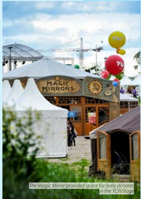
The Magic Mirror provided space for lively debates in the YO!Village

Unsustainable consumption and production patterns need to be tackled urgently. The EU has a particular duty to take action, being responsible for a disproportionate level of global consumption. Consumer education is urgently needed. Citizens need to be made better aware of their responsibilities and the consequences of over-consumption of energy and resources. In parallel, the promotion of alternatives that ensure greater efficiency and a more equitable distribution of consumption must be prioritised. Youth Organisations are a key resource in this, using non-formal education as a proven and effective tool for social change.