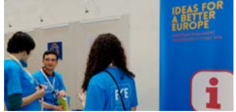
Three EYE volunteers in one of the many helpdesks around the Parliament