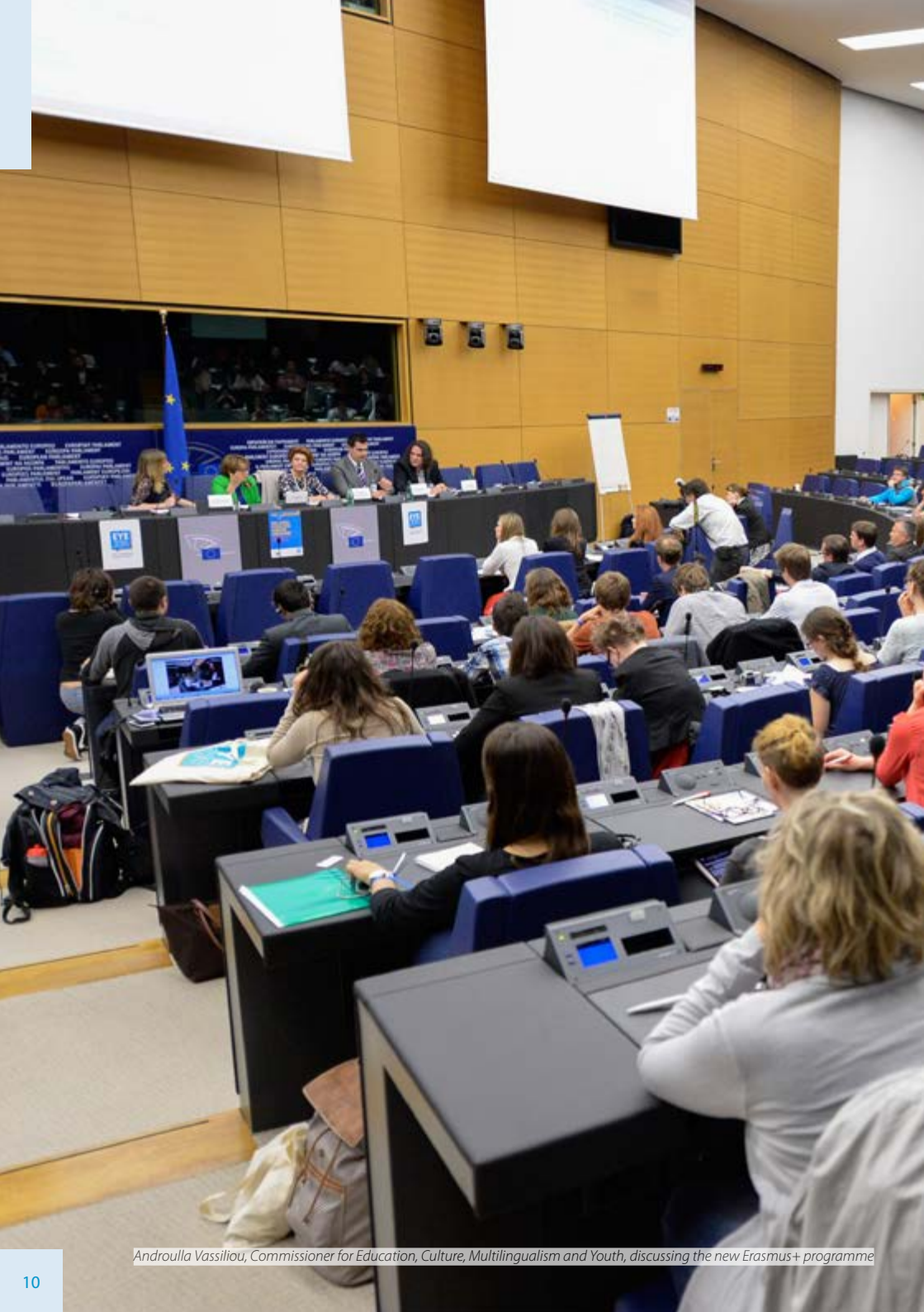
Androulla Vassiliou, Commissioner for Education, Culture, Multilingualism and Youth, discussing the new Erasmus+ programme