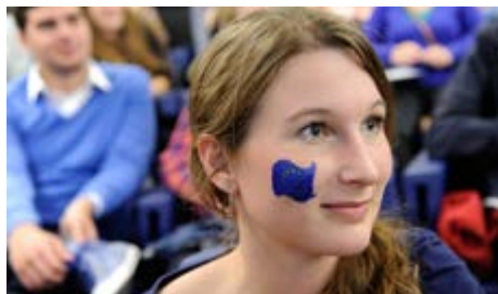
A coloured cheek for a colourful weekend

Some topics were discussed with the audience, who had the opportunity to ask questions and vote on proposals from the idea-givers. While the improving of awareness of the right to privacy online proposal was approved of by 83.7% of those who voted, the voting on a gender quota removal had a much closer result – close to half of those who voted agreed with removal, 35% were against, and 17% abstained.