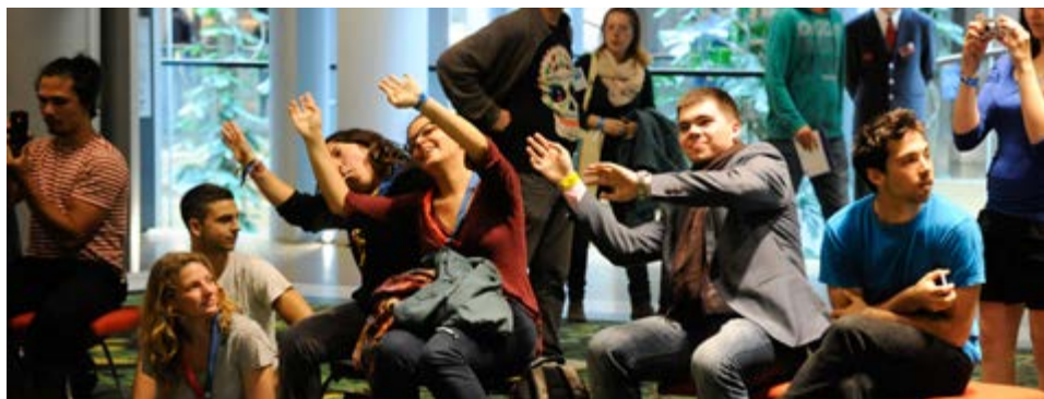
Participants watching and cheering during a spectacle in the flower bar

"Nobody knows what Europe is - it's messy, but it's nice!"