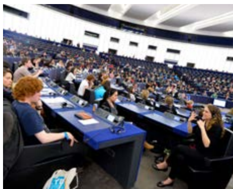
Sign interpretation at the EYE 2014

With the YO!Fest public concerts in the City of Strasbourg and Wacken, the EYE reached well beyond the 5,500 participants, enticing an additional 4,500 people to the European Parliament and the Youth Forum. The concerts provided a hook to reach out to local people in Strasbourg and the less engaged young people, and motivating a significant number to participate in other YO!Fest activities.