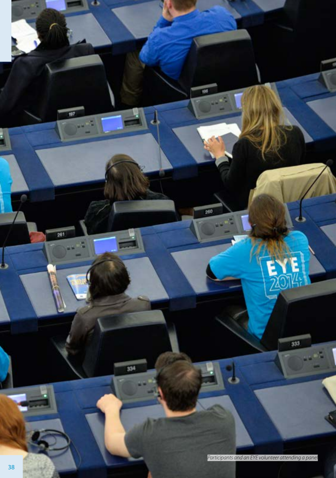
Participants and an EYE volunteer attending a panel