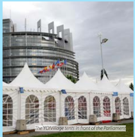
The YO!Village tents in front of the Parliament

Achieving quality youth participation is vital in order to foster a culture of responsible, proactive and democratic citizenship. Young people must be empowered and included in social, political and economic decision-making, including their meaningful participation in the formulation and implementation of development-related policies and actions. Youth organisations are an essential partner in developing sustainable youth participation processes. They must be recognised for their role in empowering young people through non-formal education and should be considered a constant partner in decision-making processes.