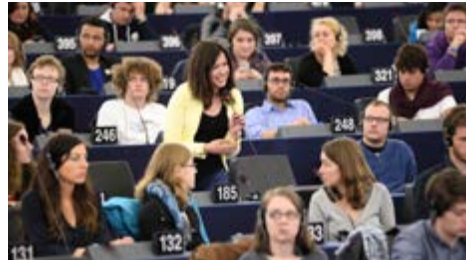
Taking the floor during a session

a study in the UK showed that such cameras have little impact on the overall crime rate.