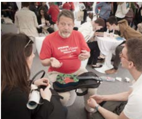
Talking about experiences of discrimination – the Living Library organised by the Council of Europe

While all of these incidents occurred outside of the European Union, Basille stressed that it is not always necessary to look outside of Europe to find human rights violations with regard to press freedom; rather, more than half of the EU countries are placed in the middle of the index.