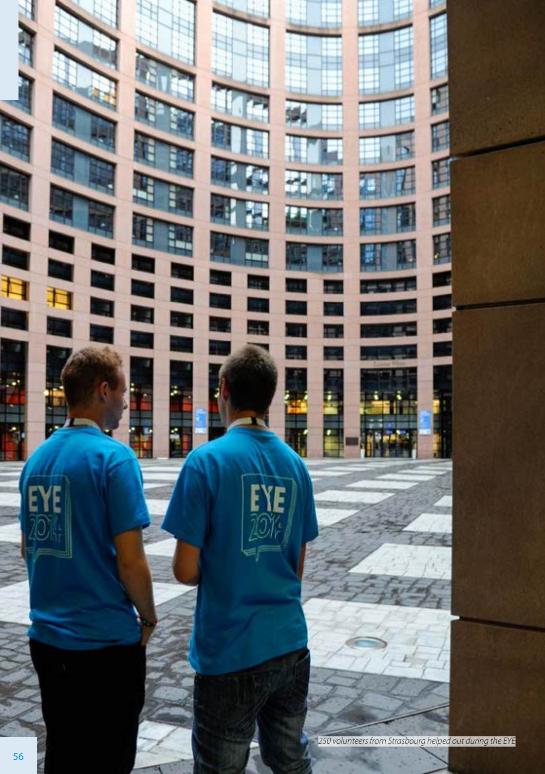
250 volunteers from Strasbourg helped out during the EYE