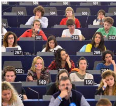
Young participants taking the seats of MEPs in the plenary chamber

people about how the EU functions, which encourages them to participate directly. Also, if you start voting when you're young, you're more likely to continue to do so when older", she said.