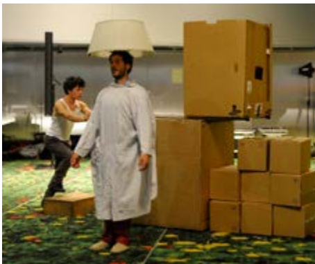
Another glimpse of the circus show in the flower bar

In a panel discussion on the future of sustainable fishing, participants noted the recent achievements of the EU with regard to legislative changes, but also the great challenges involved in implementation and achieving a common EU policy, in spite of the fact that some countries are much more affected than others. The participants criticised the strong lobbying which recently led to the rejection of a phase-out of destructive deep-sea bottom trawling by a thin majority in the Parliament, and it was felt that the issue should be put on the agenda again. Moreover, many participants, in particular those of southern European origin, called for more incentives and support for fishermen in their countries, in order to, for example, earn a living with fishing tourism. They felt that the quotas and excessive EU regulation negatively affect their communities. Panellists and participants alike suggested greater flexibility with regard to quotas so that less fish is thrown back into the sea, and for incentives for a diversification of the European diet towards other fish species.